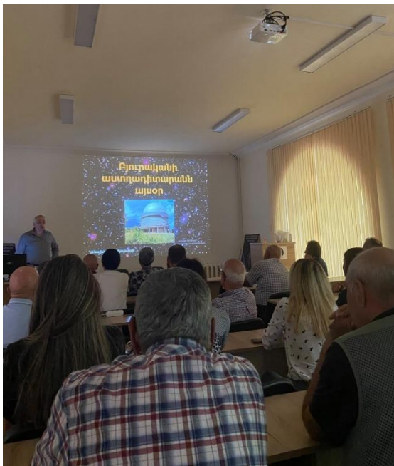
Joint Seminar of BAO, IPR and IRPE. BAO.

On 16 July, NAS RA Byurakan Astrophysical Observatory after V. A. Ambartsumian (BAO) held a seminar in cooperation with Institute for Physical Research (IPR) and The Institute of Radiophysics & Electronics (IRPE) of NAS RA. During the seminar the current status, main research fields and achievements of the institutions were discussed aiming at getting acquainted with the scientific activities of each institute, promoting interdisciplinary research, as well as discussing possible collaborations.