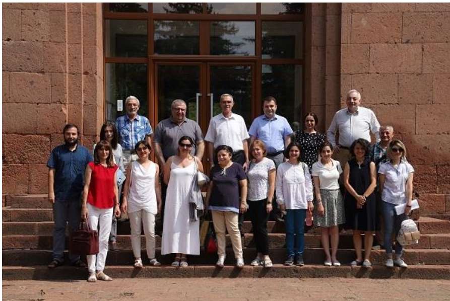
ANSEF Award Winners 2021. BAO.