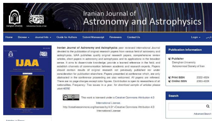
Screenshot of IJAA Website

The IJAA publishes quality original research papers, comprehensive review articles, short papers in astronomy and astrophysics and its applications in the broadest sense.