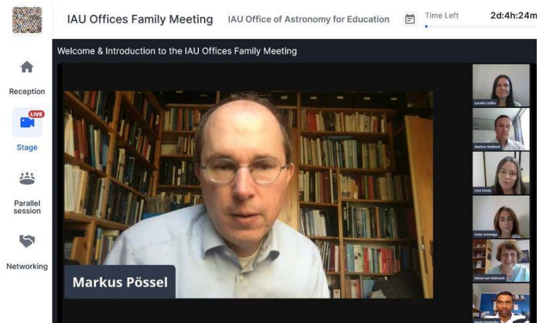
Screenshot of the IAU Offices Family Meeting