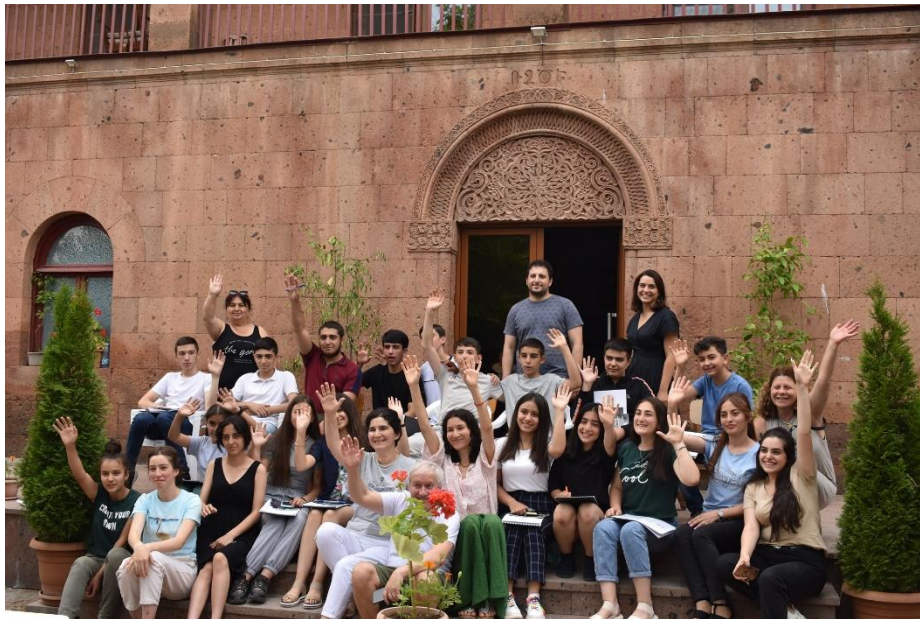
Math Camp Participants. BAO.

During the camp, the children participated in Math classes conducted by famous Russian mathematicians, got acquainted with the activity and achievements of BAO, visited the telescopes, Victor Ambartsumian House-Museum, and had night observations with telescopes. Moreover, the participants had meetings with people of other professions, and made visits to nearby sights.