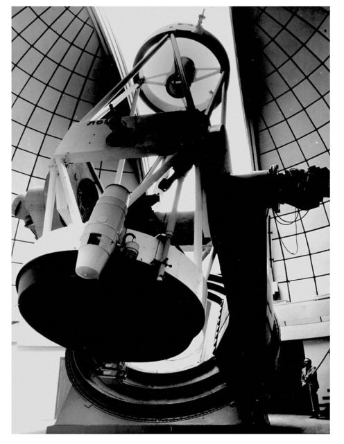
BTA-6m (SAO, Russia) and ZTA-2.6m (BAO, Armenia) telescopes by B.K. Ioannisian

He took up questions on projection, construction and mounting of astronomical instruments and devices. In common with D.D. Maksutov he began working on the implementation of meniscus systems of telescopes in astronomy. He is considered to be the author of a number of new original constructions of astronomical instruments. He has created the ASI-1 nebular spectrograph (1949), the ASI-2 meniscus telescope with 500mm in diameter (1959), a number of original instruments though of small size (ASI-4 mirror-lens, ASI-5 reflecting telescope with a slitless quartz spectrograph, Alma-Ata 60cm, as well as (in common with Maksutov) one of the world largest meniscus telescopes with automatic system of management; the AC-32 mounted in the Abastumani Astrophysical Observatory (with a telescope aperture of 700mm and a main mirror of 975mm in diameter). In 1961 the mounting of ZTSh reflector (a mirror telescope after G.A. Shain) with a mirror of 2.6m in diameter was completed at the Crimea Astrophysical Observatory of the