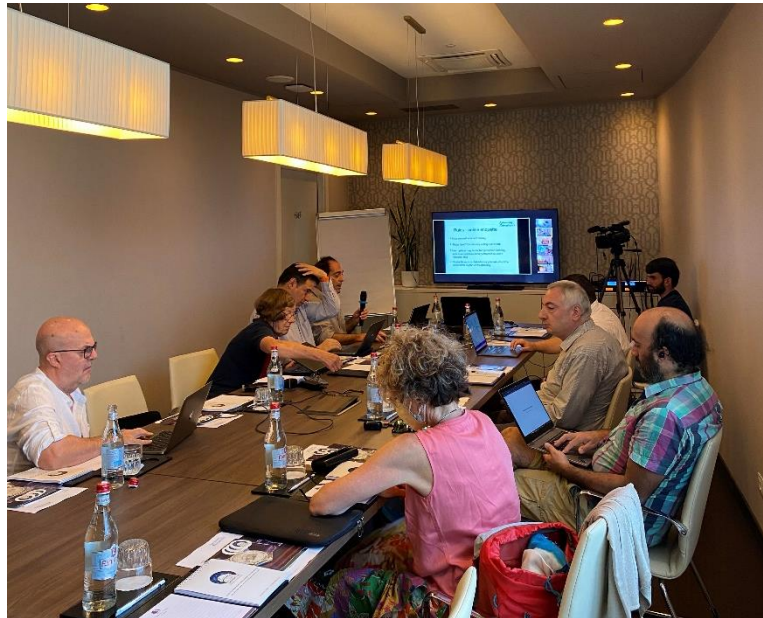
A&A Board of Directors Meeting. Yerevan. Armenia.