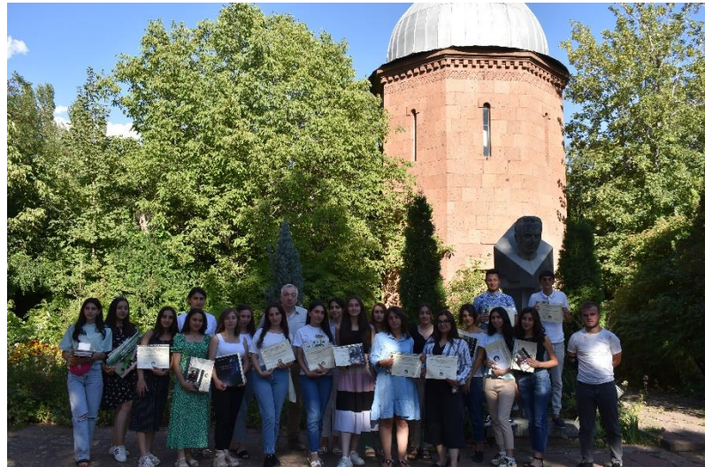
Byurakan Summer School for Artsakh Students

Within the framework of the program, the students