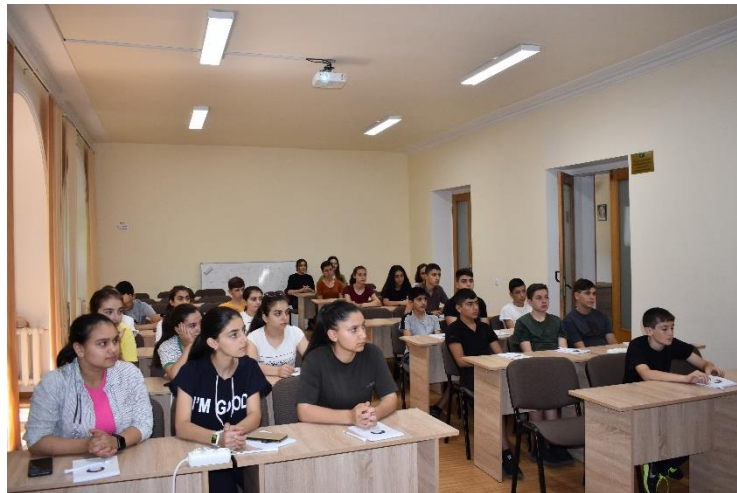
BSCA Participants. BAO.

The children also took part in games, as well as acquired some practical skills, such as launching a mini rocket from the observatory.